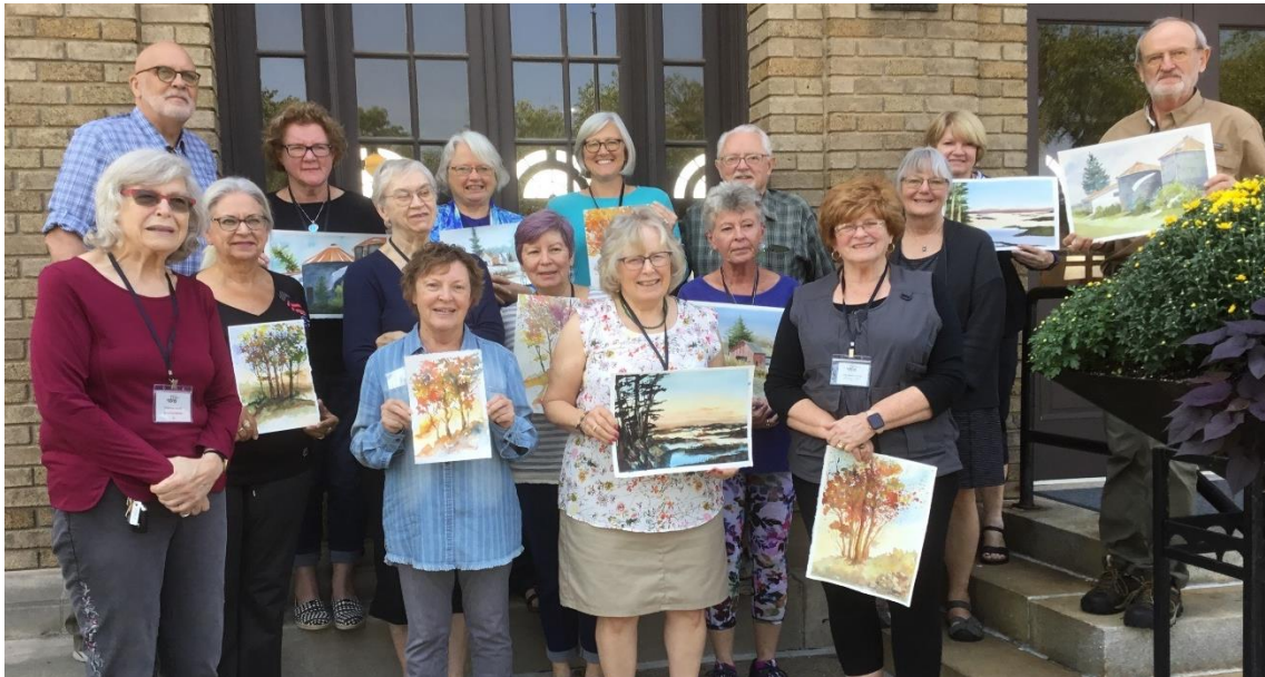
Students in the Michael Holter landscape workshop